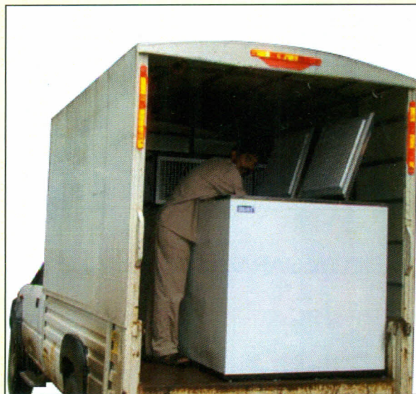
48cft FOW for Tata Ace/ Mahindra pick up/Bolero etc