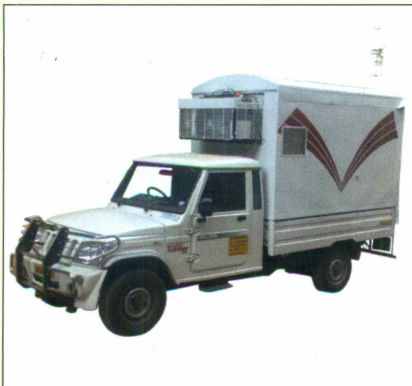
FOW SARAH-MAXI for Mahindra Maxitruck/bolero pick-up