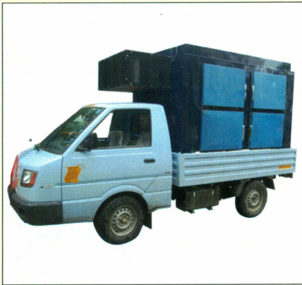
FOW SARAH-OPTIMUS for Ashok Leyland DOST