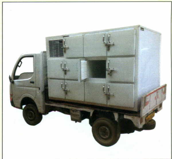
11 door TDU(Tertiary Distribution Unit) for Tata ACE.

We are the only exclusive approved manufacturers of TDU/ FOW for Hindustan Unilever Ltd