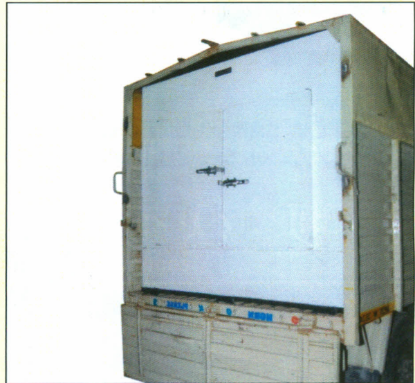
FOW SARA-H-STAR for 407