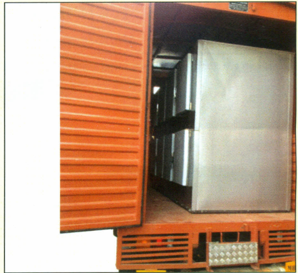
FOW SARAH-TOURER for Eicher, Tata 407, Mahindra bolero pick up