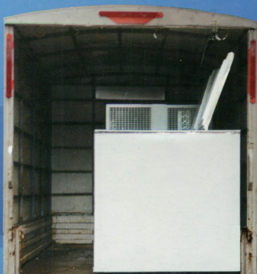
45 CFT FOW for TATA Ace / TATA 207 / Mahindra pick-up vehicle