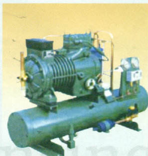
Condensing Units with Semi Hermetic Compressors of all brand as per the Customer's request & suitability of the requirement. Air Cooled & Water Cooled.