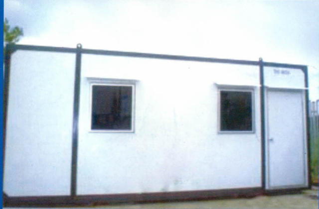
Pre-Fabricated PUF Panels/Door Systems & Total Cold Room Construction Solution