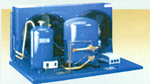
Reciprocating Hermetically Sealed Compressor of all reputed make with Air & Water Cooled Condensers.